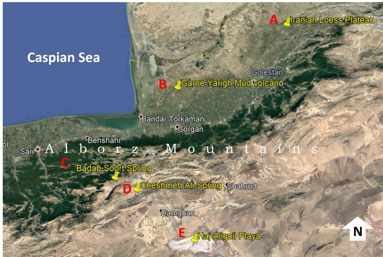
Figure 1: Google earth view of the excursion sites

During excursion, the Caspian Lowlands, the Iranian Loess Plateau, the Alborz Mountains and the northernmost part of the Central Plateau will be visited (Figure 1).