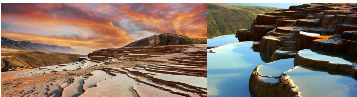
Figure 4. Badab-e Surt Spring

BSs (Figure 4) is including two springs, one with the saline and the other spring water has a sour taste and orange color. They formed during Pleistocene and Pliocene, by the time the discharged cool bicarbonate-rich waters from these springs has resulted in the formation of red, orange and yellow travertine terraces with crystalline crust, pisoid, tufa, and carbonate black muds lithofacies (Sotohian and Ranjbaran 2015).