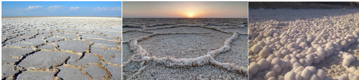
Figure 5: Damgan Salt Playa

Discovered Upper/Epipaleolithic periods settlement evidences in the area indicating that climate during the late Pleistocene was different from than present (Vahdati Nasab and Hashemi 2016).