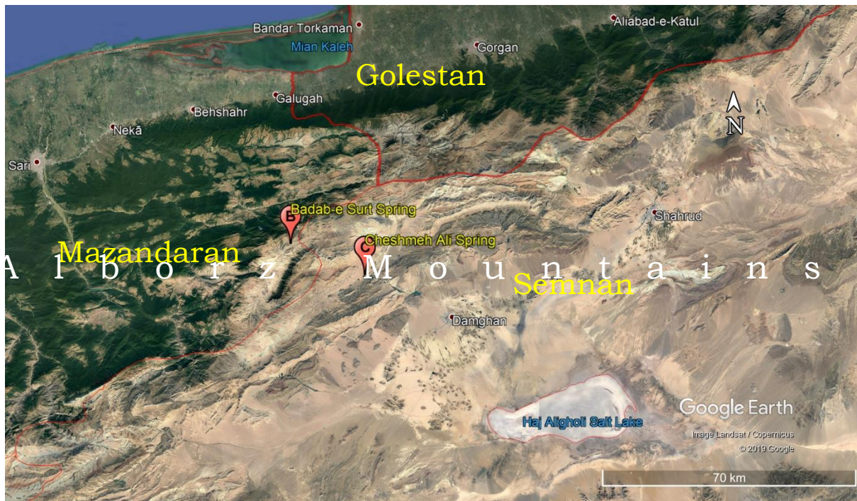
Figure 3: Satellite view of Haj Aligholo Playa, Cheshmeh Ali and Badab-e surt springs