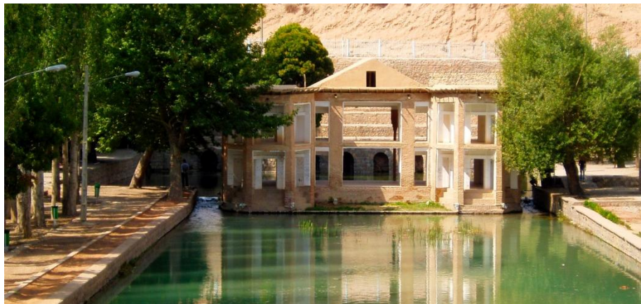
Figure 6: Cheshmeh Ali and the constructed palace

The biggest karstic spring in Semnan province called Cheshme-Ali (CAs)(Figure 6) is located at 30 km of NW Damghan and is one of Damgan desert catchments. CAs water discharge is 500-700 l/s and which provides drinking water for part of Semnan city and 25 nearby villages. Average annual precipitation of the CAs watershed is 155 whereas the number for the evaporation is 1900 mm. Geologically CAs is a part of eastern Alborz zone which is combination of the thick Delichae and thin Lar calcareous formations (Hosseini et al. 2018).